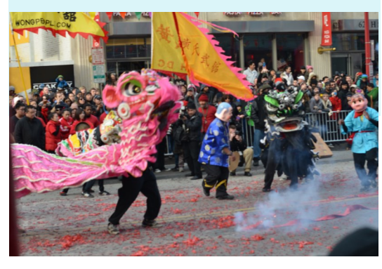
Chinese New Year Parade, Washington, DC